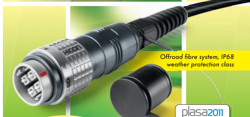
Offroad fibre system, IP68 weather protection class