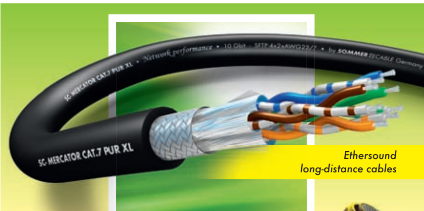
Ethersound long-distance cables