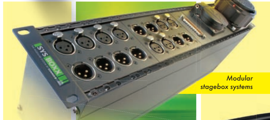
Modular stagebox systems